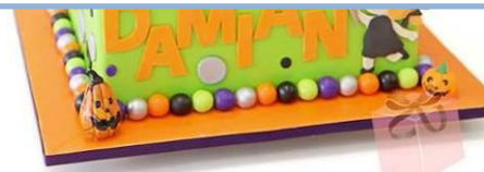
Pink Cake Box